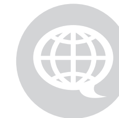
Language & world culture