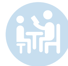
Smaller class sizes