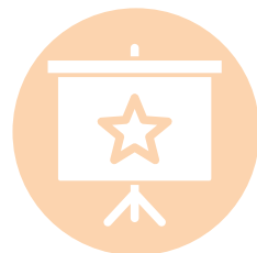
Exceptional teachers & staff

Your child, and all of our children, benefit from the rich legacy of generous and consistent giving from families and community members over the past 35 years. The funds provided by HSF are used as part of the actual operating budget to cover the expenses of providing a rich educational environment found in the Hillsborough schools. The Hallmarks of this education are: