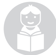
Excellence in math & reading